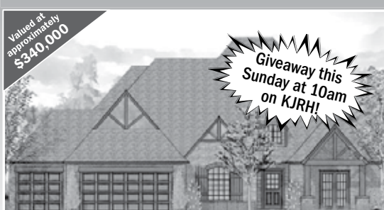
Home built by Willcut Properties in Carlisle at Yorktown community